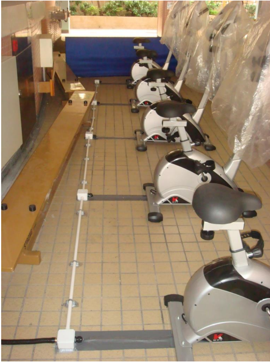
Kinetic bicycle 動能單車